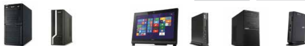
M series X series Z series N series Extensa Chromebox