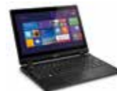
TravelMate | B1 series