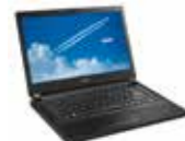
TravelMate | P4 series