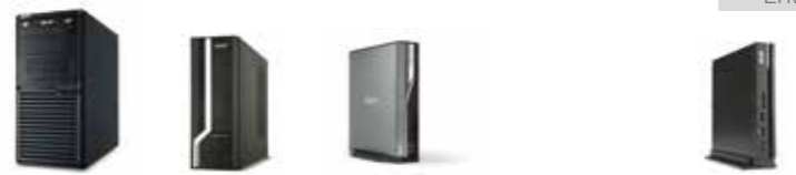
M series X series L series N series