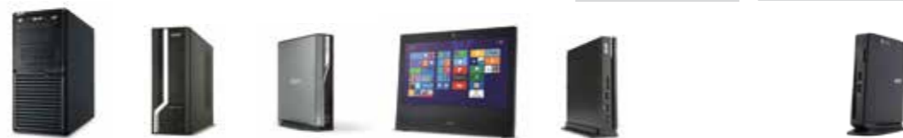
M series X series L series Z series N series Chromebox