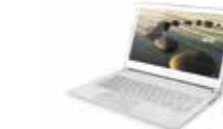
Aspire Pro S7 series