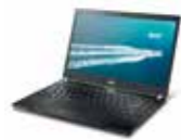
TravelMate | P6 series